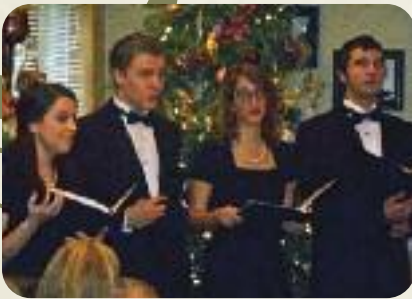
Carolers from Minnetonka High School and Armstrong High School fill the air with Christmas cheer!