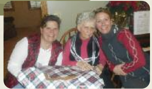
Christmas means family at Gianna Homes.