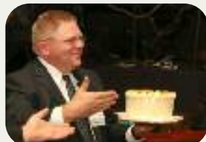
Cakes for sale during the live auction.