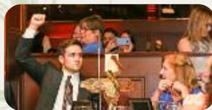
Competitive bidding during the auction