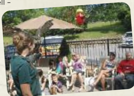
Our feathery friend shows off his wingspan