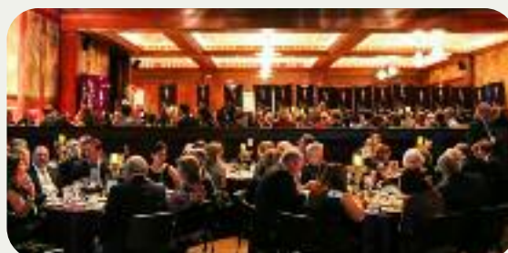
Guests enjoyed the catering of D'amico