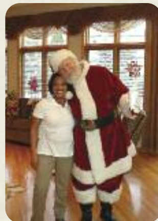
Santa visited with all the residents in 2014 and filled the home with Christmas spirit.