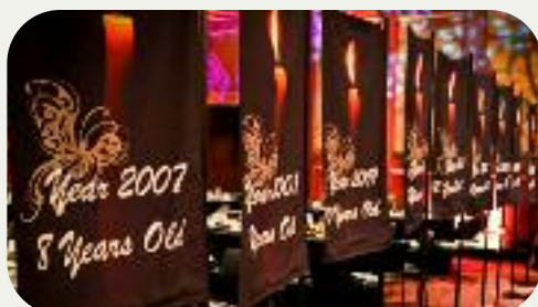
Banners lined the floor representing each of our 16 years of history