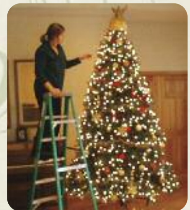
Time for trimming the tree!