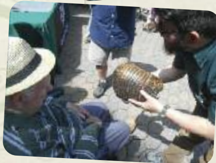
Counting the bands of the armadillo armor.