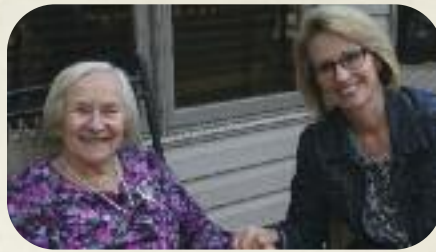
Enjoying the outdoors with family.