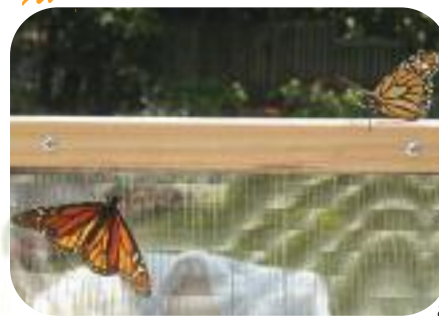
Butterflies making their first flights in the Gianna Homes gardens.

Prior to the ceremony, residents held orange slices to attract individual butterflies to their hands. With wide eyes, they got to behold the delicate loveliness of these creatures.