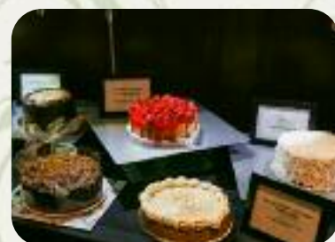
The mouth-watering cakes displayed before the dessert auction