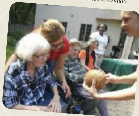
Neighborhood kids, residents, and staff meet an armadillo.