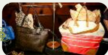
Coach bags for sale at the silent auction