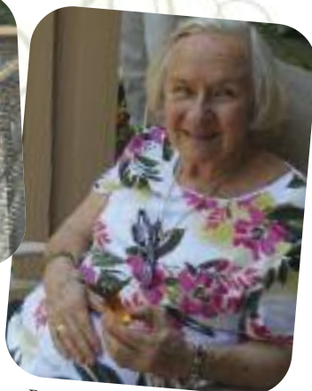
Residents and staff got to hold butterflies in their hands by luring them over with orange slices. Yum!