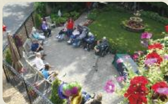
Residents from Gianna and Gladys' Place gathered together along with neighborhood families