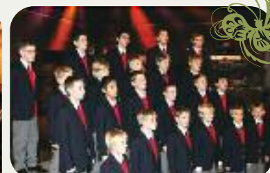
The Land of Lakes Choirboys sang several selections throughout the evening